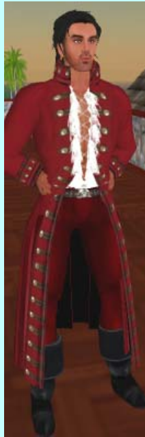
The author's alter ego, in pirate regalia.

The combination of fun, games, opportunity, and serious business intent creates so many different motivations to enter Second Life that there has been a land rush, captured by the press in the form of hype. But here are some actual adoption statistics that may come as a surprise. These stats are as of Oct. 28, 2007 end-of-day (midnight Second Life Time [SLT], where SLT = Pacific time):